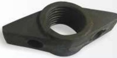
Prop Nut (Special Type) - Code : SE-452