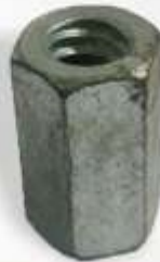
Tie Rod Connector - Code : SE - 205