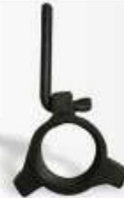
Prop Nut 3 Way - Code : SE-409