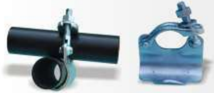
Put Log Coupler - Code : SE-003