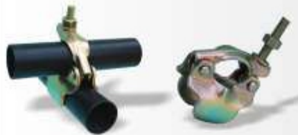
Oyster Coupler - Code : SE-108