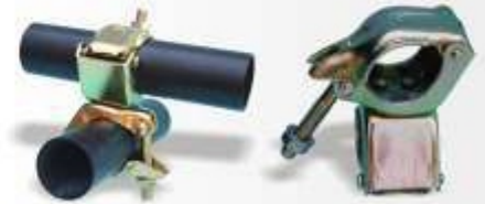
Korean Type Double & Swivel Coupler - Code : PH - 106