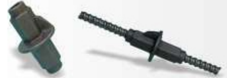
Water Stopper - Code : SE-403