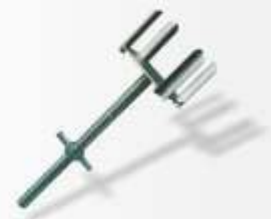
Fork Head Jack - Code : SE-056