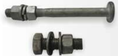
Bolt Nut - Code : SE-459