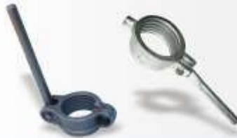
Prop Nut - Code : SE-405