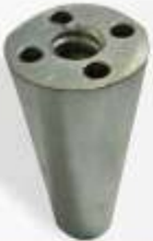
Anker Cone - Code : SE-407