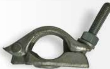
Half Coupler - Code : SE-411