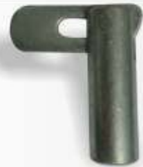
H - Frame Pin - Code : SE - 206