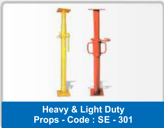
Heavy & Light Duty Props - Code : SE - 301