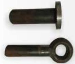
Forgings - Code : SE-006