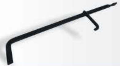
Shuttering Clamp - Code : SE-453