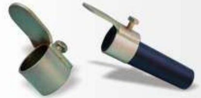
Put Head - Code : SE-109