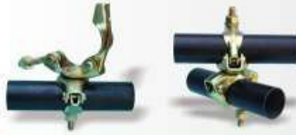
Swivel Coupler Pressed - Code : SE-102