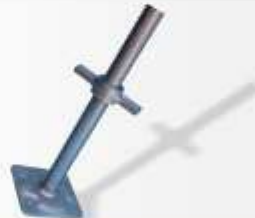
Adjustable Base Jack - Code : SE-052