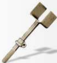
Adjustable U Head Jack - Code : SE-054