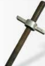
Universal Jack - Code : SE-053