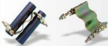
Roofing Coupler - Code : SE-107