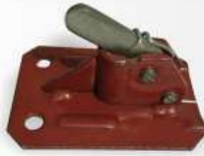
Spring Clamp - Code : SE-413