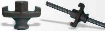
Wing Nut - Code : SE-402