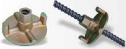
Anchor Nut - Code : SE-401