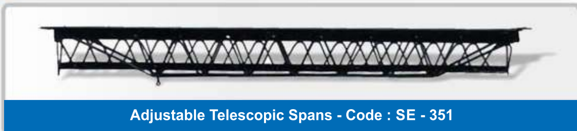
Adjustable Telescopic Spans - Code : SE - 351