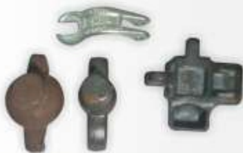
Other Forged Items - Code : SE-457