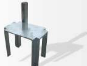
Fork Head - Code : SE-055