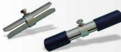
Joint Pin - Code : SE-105