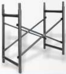
H Frames - Code : SE - 201