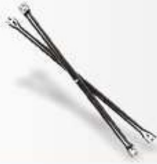
Cross Braces - Code : SE - 202