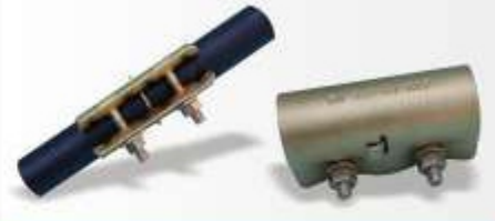
Sleeve Coupler - Code : SE-103