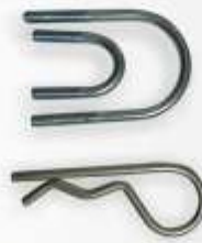
U Bolt Clips - Code : SE-458