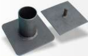
Base Plate - Code : SE-051