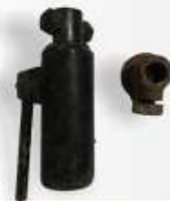
Go Go Nut - Code : SE-412