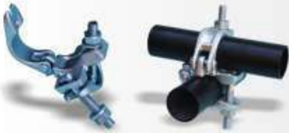
Double Coupler - Code : SE-001