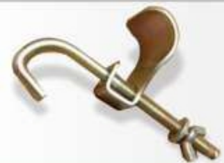
Ladder Clamp - Code : SE-112