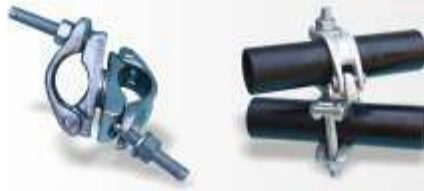
Swivel Coupler - Code : SE-002