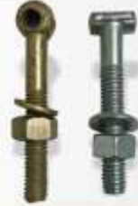
T Bolt - Eye Bolt - Code : SE-415