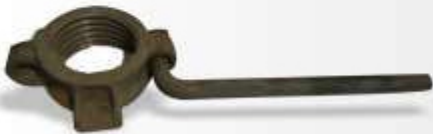
Prop Nut L & T Type - Code : SE-410