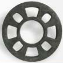
Ring - Code : SE-451