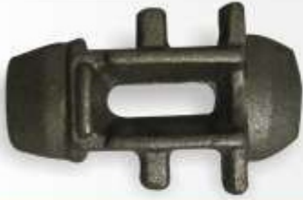
Omega Ledger Blade - Code : SE-413