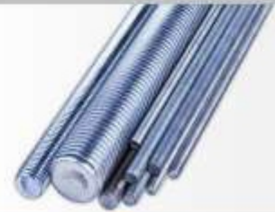
Threaded Bar - Code : SE-406