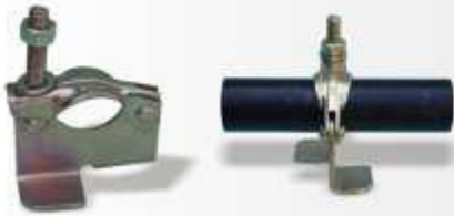
Board Retaining Bracket (with Forged & Pressed) - Code : SE-104