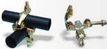
Double Coupler Pressed - Code : SE-101