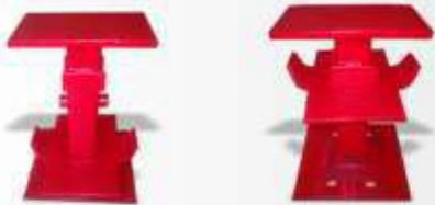
Drop Heads - EN-74/BS-1139 - Code : SE-454