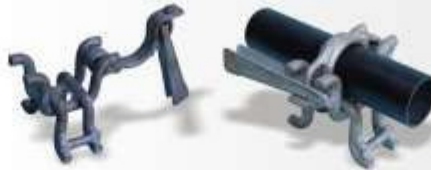
Wedge Coupler - Code : SE-455