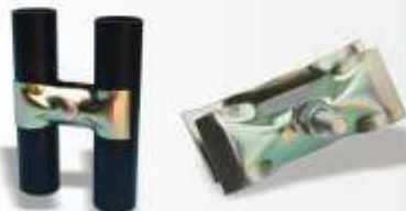
Fencing Coupler - Code : SE-111