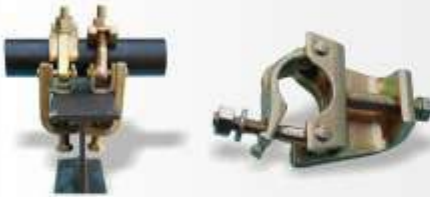
Girder Coupler - Code : SE-004