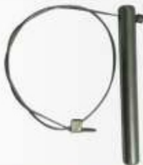
Wire Lock Pin - Code : SE - 204