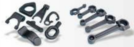
Other Forged Items - Code : SE-453