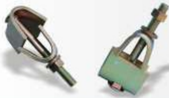
Universal Clamp - Code : SE-110