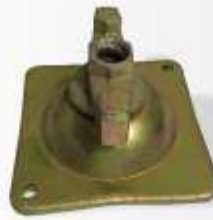
Wing Nut with Plate - Code : SE-408