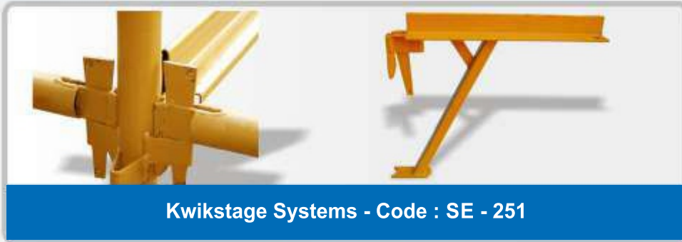
Kwikstage Systems - Code : SE - 251