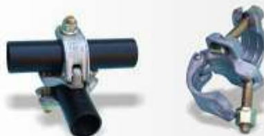
Double Coupler Heavy Duty - Code : SE-005